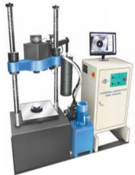
Customized Brinell hardness Testers

*PC & Printer is not in our standard scope of supply.