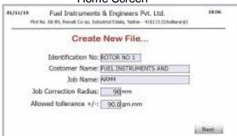
New File Creation